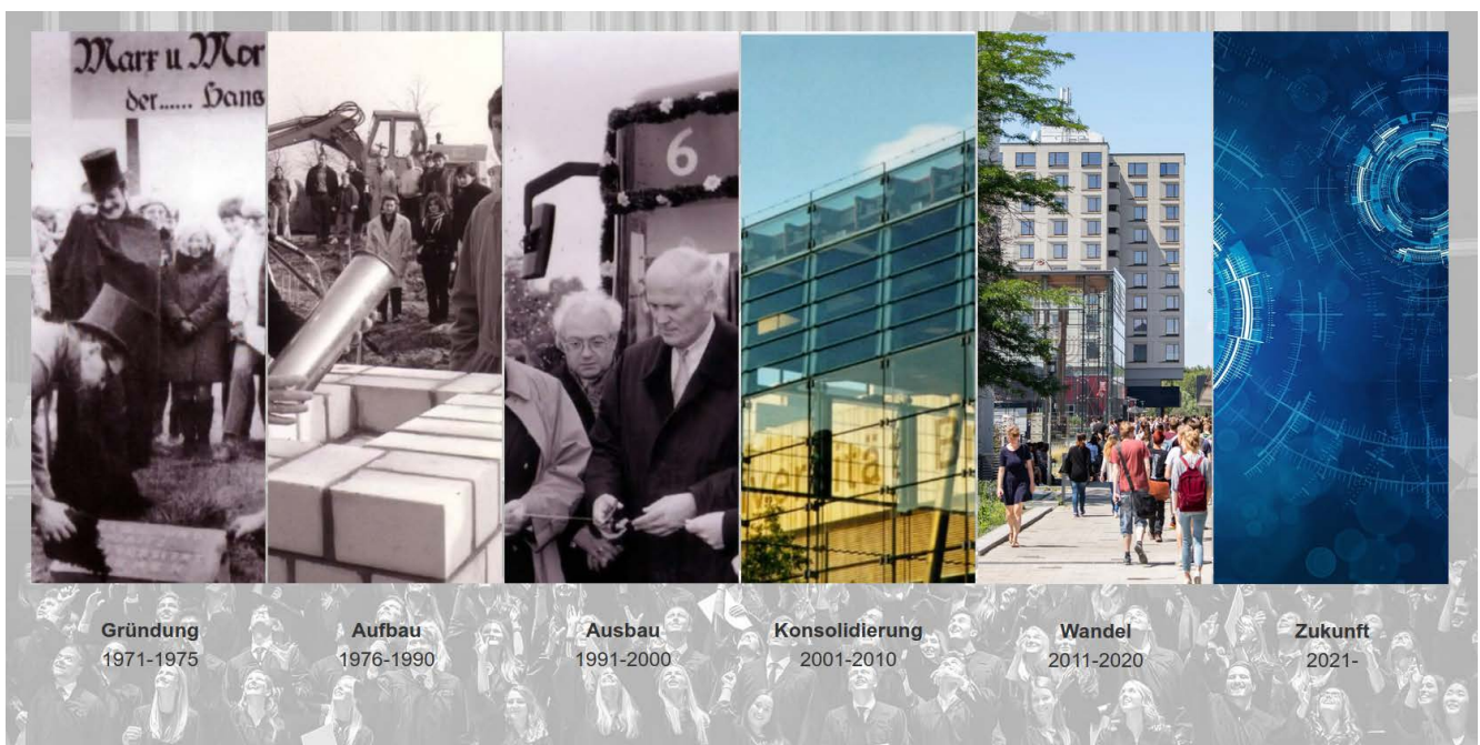
The phases of development of the Faculty of Business Studies and Economics

https://blogs.uni-bremen.de/50jahrewiwi/